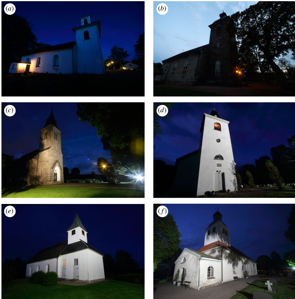
Figure 1. Examples of the three categories of flood-lighting used on the churches examined during this survey; (a,b) not lit, (c,d) partly lit, (e,f) fully lit. All churches shown harboured colonies of long-eared bats in the 1980s. In 2016 the colonies were gone from (d) and (e) but remained in (a–c) and (f).

the outside. In all cases the emerging bats were unambiguously recognized as Plecotus because their diagnostic long ears could be seen.