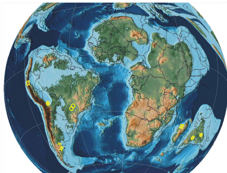
Figure 3. Distribution of Gondwanan landmasses in the Late Cretaceous (80 Ma) and known mammalian records. Circle, eutherian; square, indeterminate tribosphenidan; plus, non-tribosphenidan (map generated using the softwares GPlates 2.0.0 www.gplates.org and PaleoData Plotter https://www.earthbyte.org/paleomap-paleoatlas-for-gplates/ ; [66]).

whereas the faunal assemblage of northern South America suggests a closer biogeographic relation with Africa [63,65].